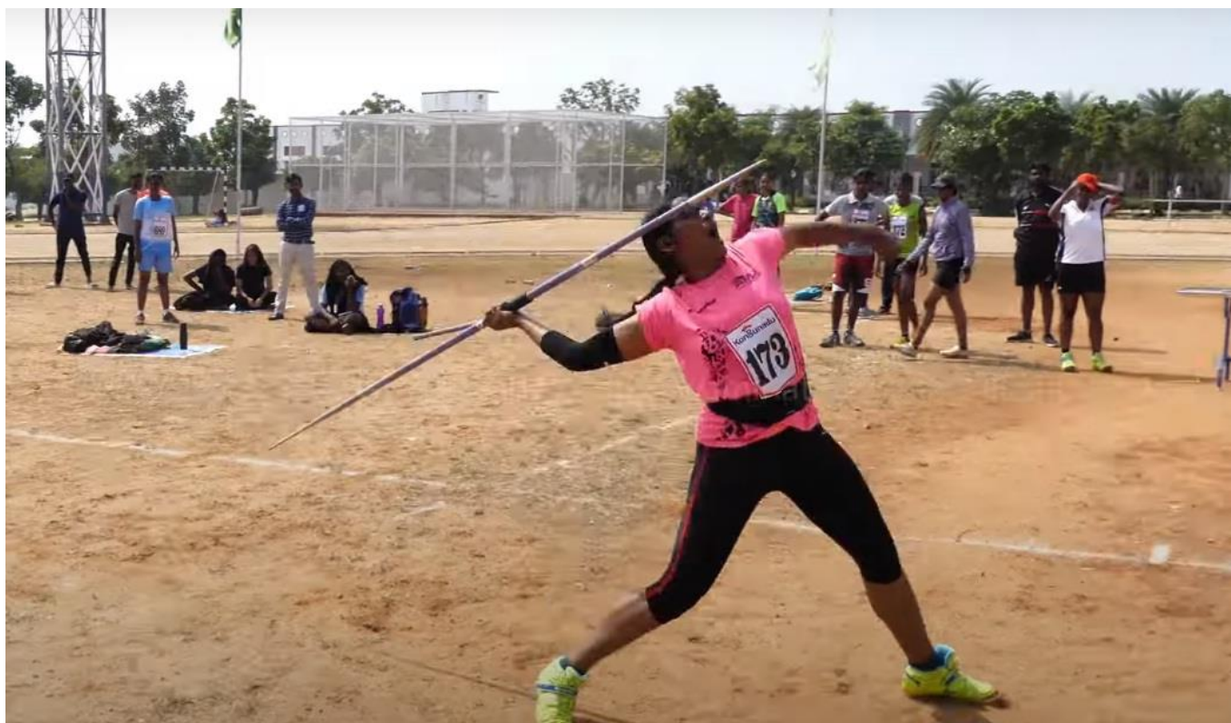
Anna University selection trials event