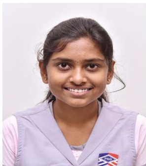
C.NAVEENA IV CIVIL (TAPTI)