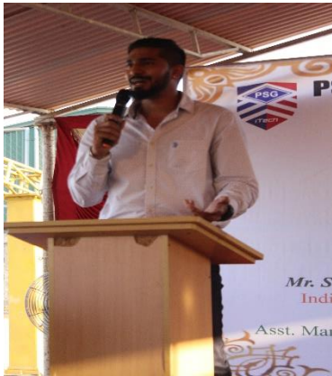
Chief Guest addressing the gathering .